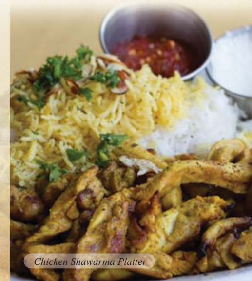
Chicken Shawarma Platter