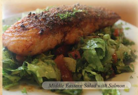
Middle Eastern Salad with Salmon